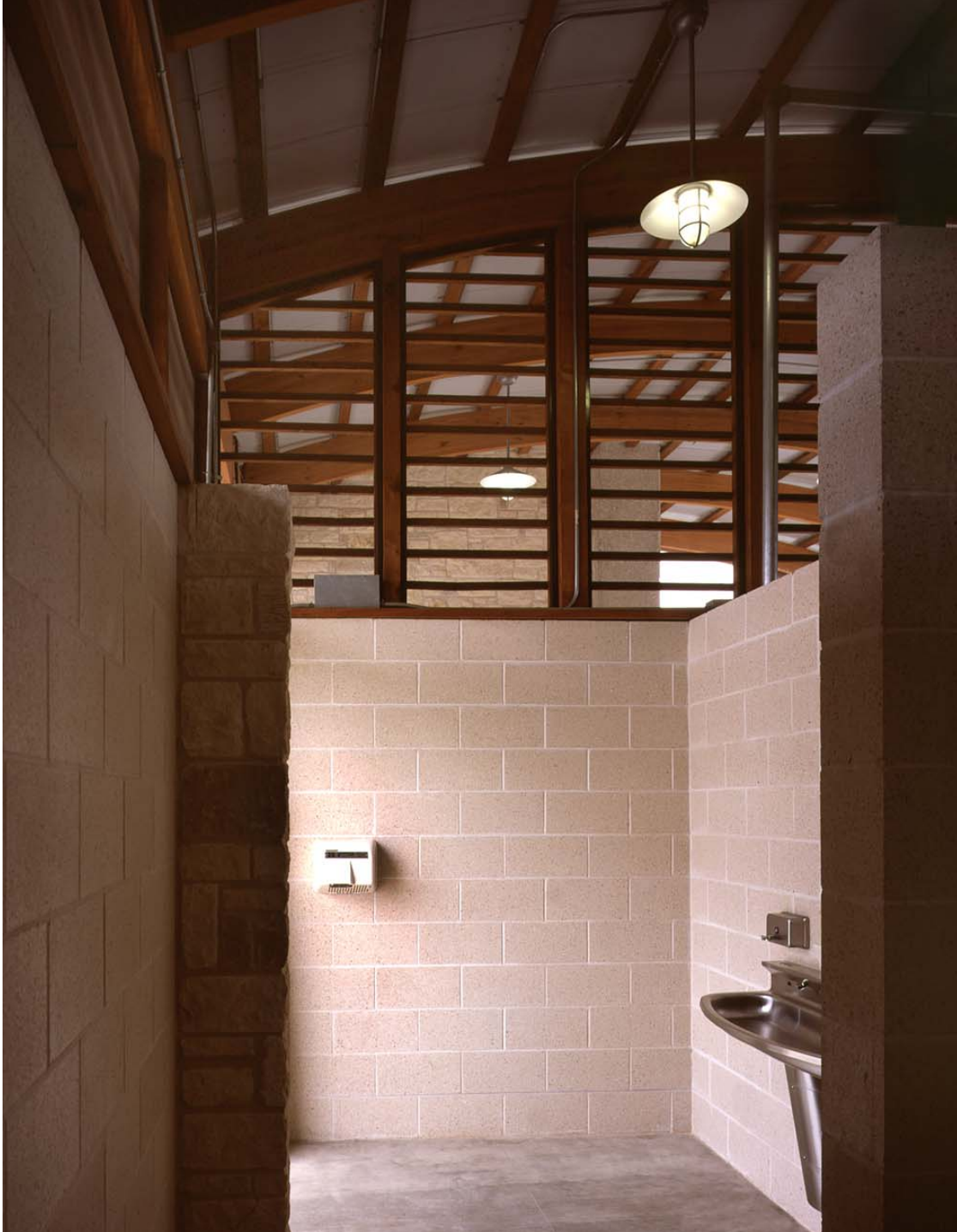
Lakeway Pool House