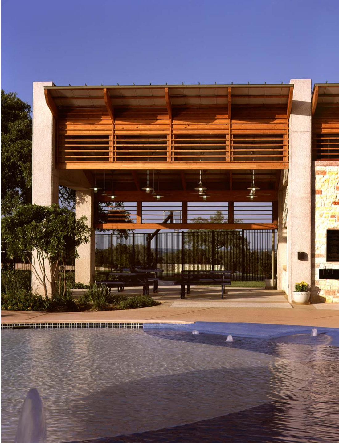
Lakeway Pool House