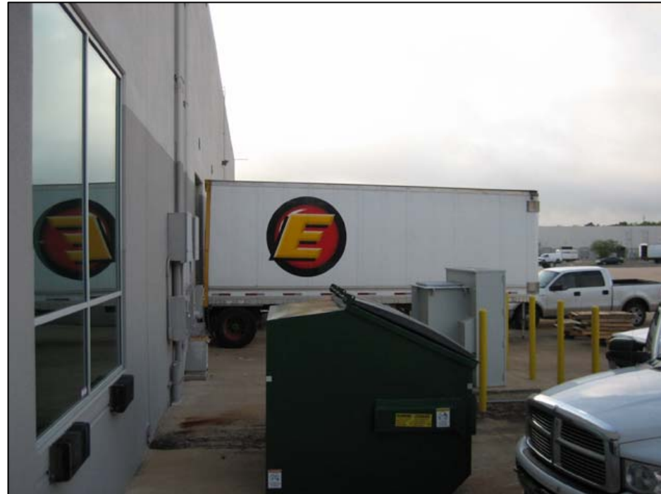
Carpet Take Back Program