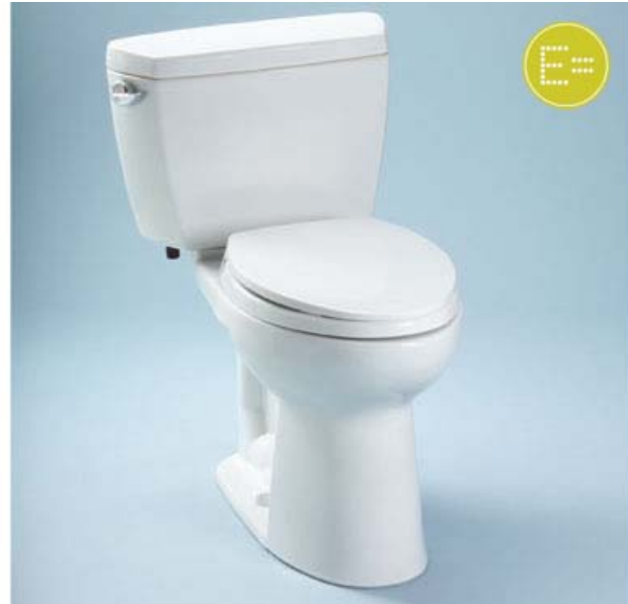
Toto Toilets: EcoNexus and EcoDrake ADA