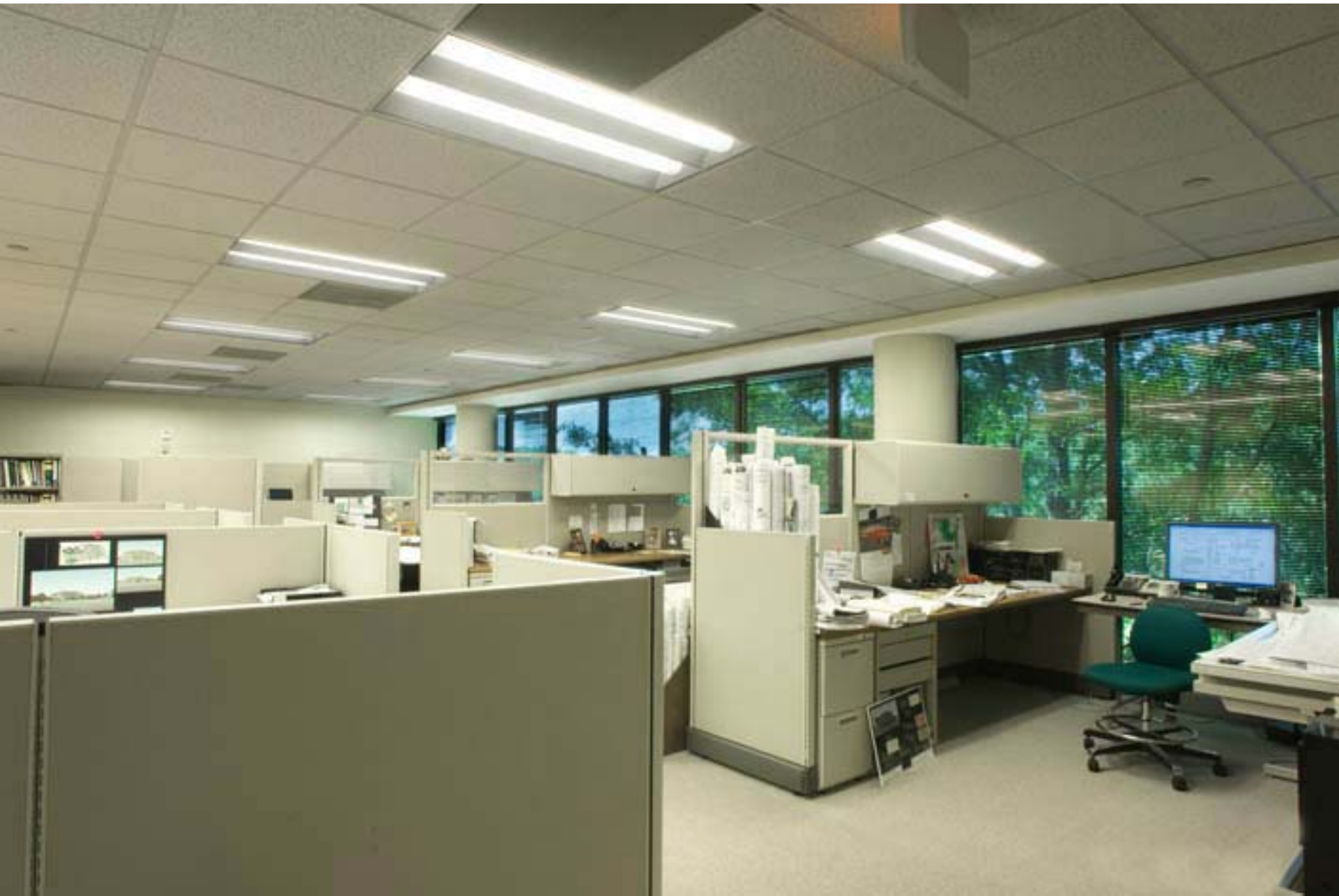
RT5 Light Fixture